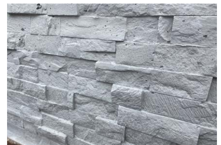
FACING PATTERN Scale (A) 1:10